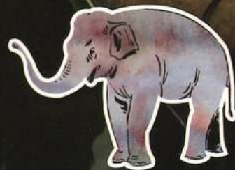
The Thief and the Elephant