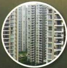
Welcome to China