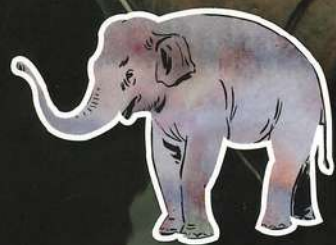
The Thief and the Elephant