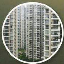
Welcome to China